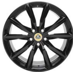
Design wheel, Gloss Black, forged (19" front and 20" rear)

The 5 wheels below will make up the remainder of the range.