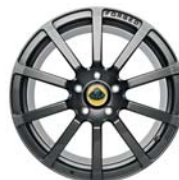
Sport wheel, Gloss Anthracite, forged (18" front and 19" rear)