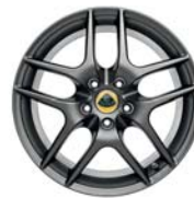
Classic wheel, Stealth Grey, cast (18" front and 19" rear)