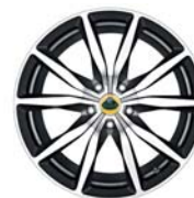
Design wheel, Diamond Cut, forged (19" front and 20" rear)

Please note that the Sport Diamond Cut and Turbine Diamond Cut wheels are no longer offered as production fit but will continue to be available through ASO.