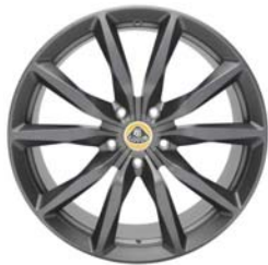
Design wheel, Gunmetal Grey, forged (19" front and 20" rear)

There will be a range of 7 wheels for the MY12 Evora with 2 new additions: Satin Gunmetal and Gloss Black, both in a 19"/20" Design Wheel layout.