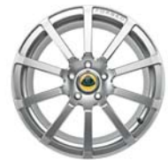
Sport wheel, Silver, forged (18" front and 19" rear)