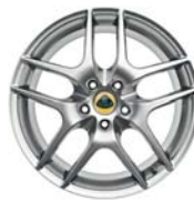
Classic wheel, Silver, cast (18" front and 19" rear)

The 5 wheels below will make up the remainder of the range.