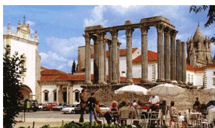
Famous Visigoth destruction in Evora, Portugal, with tourists eating the local Carne de porco à alentejana

Toyota 3.5-litre V6 DOHC, 280 HP at 6400 rpm, 0-60 around 5s.