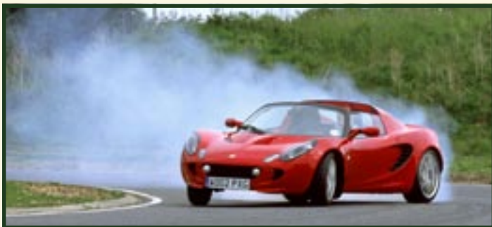
Lotus Elise in action