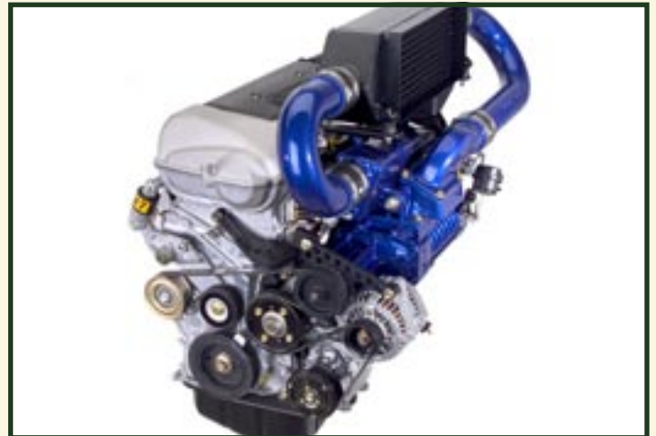
240R Supercharged Engine

The latter example draws upon Lotus Engineering's world-class SKCMS (Suspension, Kinematics and Compliance Measurement System). The custom-made vehicle measurement rig was designed, developed and made in-house by Lotus Engineering. Clients have used the SKCMS for many years to refine the characteristics of their road going cars, but now more racing teams and privateers are finding out about how the rig can help them win races!