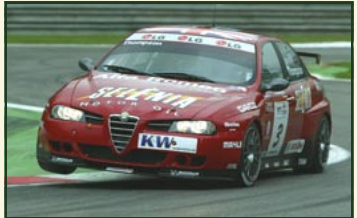
A proving ground for camless engines

Benefits are increased fuel economy and engine torque with a reduction in emissions – Lotus say the improved operational efficiency increases torque by up to 10%.