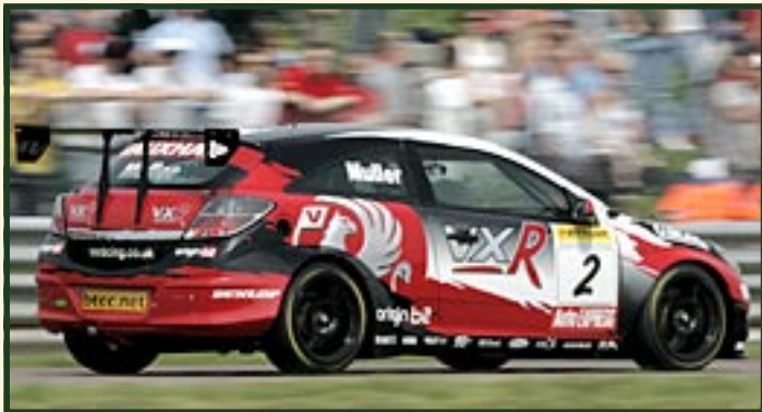
British Circuits are notoriously harsh on cars

Teams now use state-of-the-art equipment such as 3-D modelling and CAD/CAE systems to design suspensions and perform stress analysis. For example, stress analysis is required to analyze many different iterations of the same part very rapidly to meet tight deadlines, the more quickly these iterations can be performed, the more optimized the part will be.