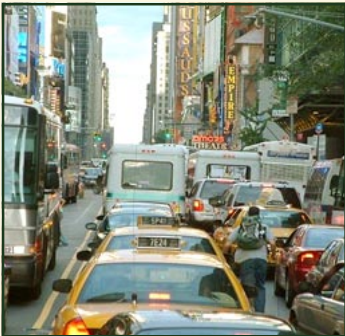
Strict emission laws could lead to more costly vehicles

According to the New York Times, US vehicle makers contend that the regulations will limit the availability of many sport utility vehicles, pickup trucks, vans and larger sedans, since they will effectively require huge leaps in fuel economy to rein in emissions. The industry also says the rules will force them to curb sales of more-powerful engines in the state, and ultimately harm consumers by increasing the cost of vehicles, the report added.