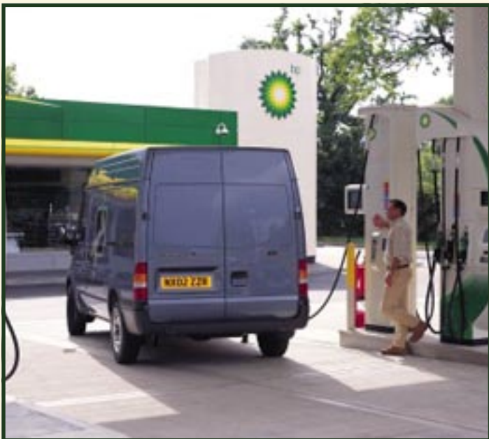
The onward march of diesel