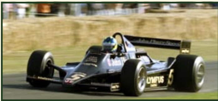
Type 79 Lotus Formula One car

Lotus Engineering has recently experienced a great demand for its services, particularly as they relate to motorsport activity. These services cover all aspects of vehicle and powertrain engineering, from engine calibration & control in the Time Attack winning Chevrolet Cobalt SS through to chassis set-up and analysis on a Mosler MT900R GT2 which competes in selected rounds of the FIA GT and British GT championships. This team recently won the Tag Heuer GT250 with the Mosler after analysis with Lotus Engineering.