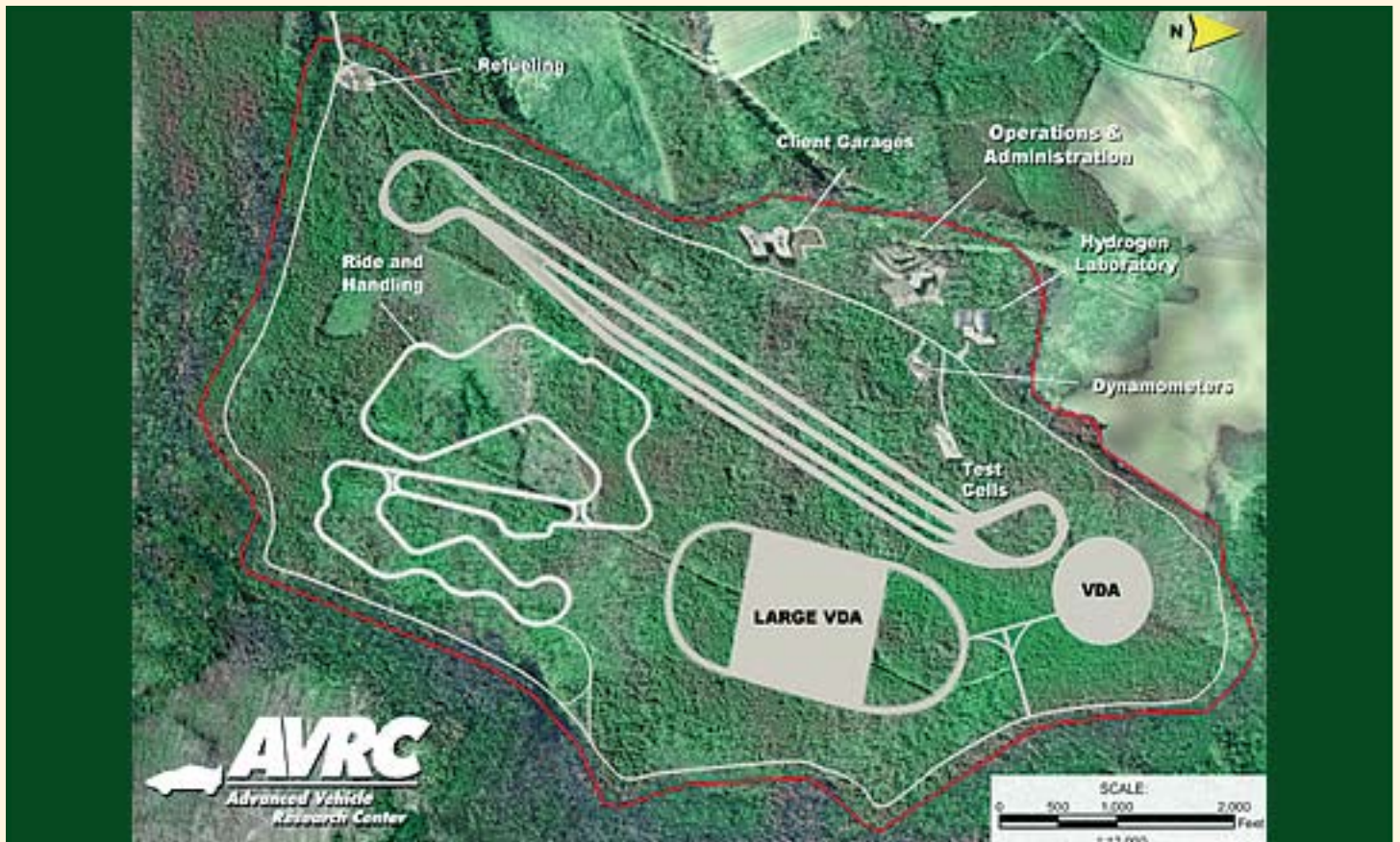
AVRC, North Carolina