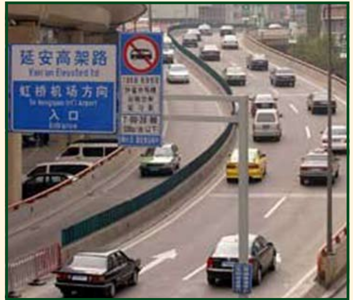
All change for Asian Driving Dynamics

As speeds have increased there has been a conscious effort by manufacturers to improve their vehicles and the most focus has been on how the car feels and how the customer feels about