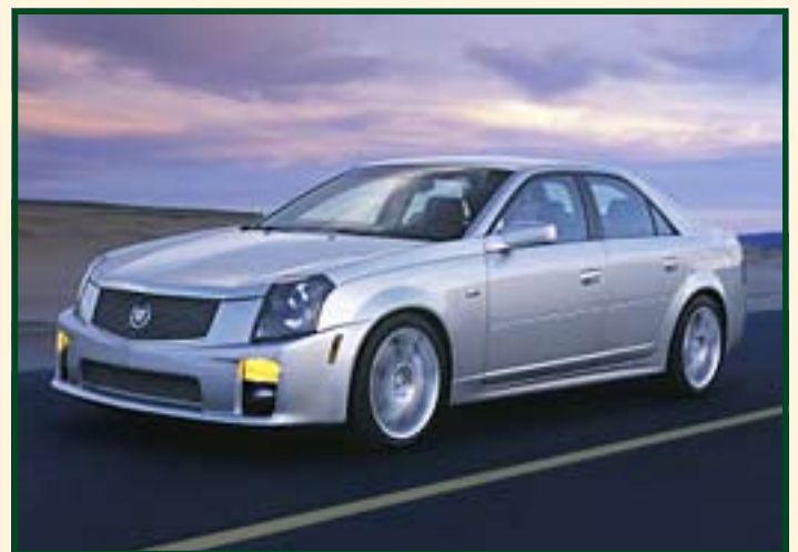
Cadillac CTS – American style, Euro handling

The challenge of producing vehicles that deliver beyond the basic expectation of the consumer requires a philosophy shift. There is no doubt the US automobile market is extremely price sensitive. Detroit's OEMs have in recent months provided heavy incentives and discount on certain vehicles, but not all. The Chrysler 300 and its Dodge brand remain strong sellers without the help of significant financial incentives – the product is desirable and competitive within the market. Products that exceed customers' expectations have a history of achieving sales.