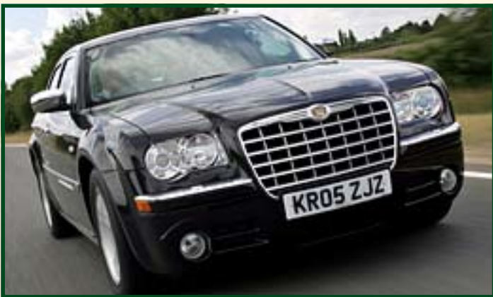
Chrysler 300C – strong visual cues, American

What will be interpreted as good driving dynamics is influenced by factors specific to the market such as road systems and driving habits.