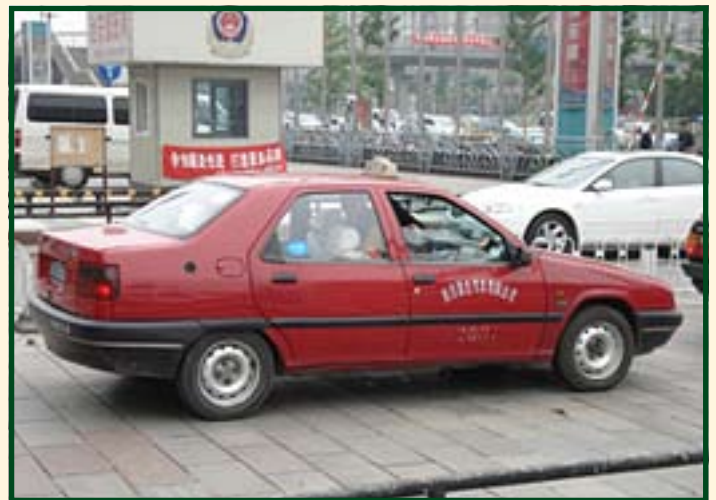
Red Chinese Taxi

The customer is very different from Europe and Japan so cars tuned for drivers or driver enjoyment may not be well received as the driving skills are not able to exploit or even understand it. The car is also a symbol of success and rank so owners do not want to be apologising for poor ride quality, noise or vibration when they are carrying colleagues or business associates. To many Chinese the car is an extension of their business or life and as such if it needs to offer all of the qualities they expect and as most have no perception of what causes cars to be noisy or have poor ride then these should not be present. In fact their first thought is that something is wrong so they will be more likely to take it back to the dealer to avoid any personal expense.