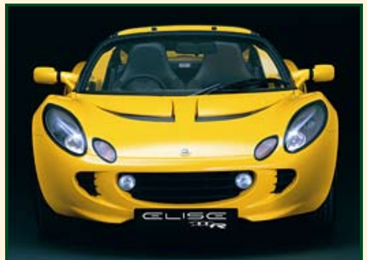
Lotus Elise – epitomises philosophy of performance through light weight

But the reality is that for most vehicles, getting the product character to meet specific market and consumer expectation is increasingly important. And driving dynamics is an area where if carmakers get it right, customers are becoming more receptive.