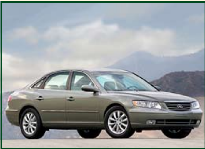
Hyundai Azera – new breed of Asian cars taking the market by storm

So to meet the needs of the increasingly aware consumer, driving dynamics must be considered at the start of new vehicle development stage. These attributes and the structural integrity of the vehicle body structure are inextricably related. A vehicle with good structural qualities is inherently superior with respect to NVH and refinement. Downstream vehicle tuning for ride, handling and NVH is more easily achieved. Similarly suspension system configuration, kinematic and compliance characteristics are key aspects it is critical to set at the outset such is their influence on a vehicle's character with respect to its driving dynamics.