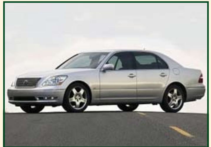
Lexus LS430 tied with Porsche Cayman to top latest J.D. Power initial quality survey

The Initial Quality Study, which serves as the industry benchmark for new-vehicle quality measured at 90 days of ownership, was completely redesigned for 2006 to capture problems experienced by owners in two distinct categories – quality of design and quality of production (defects and malfunctions).