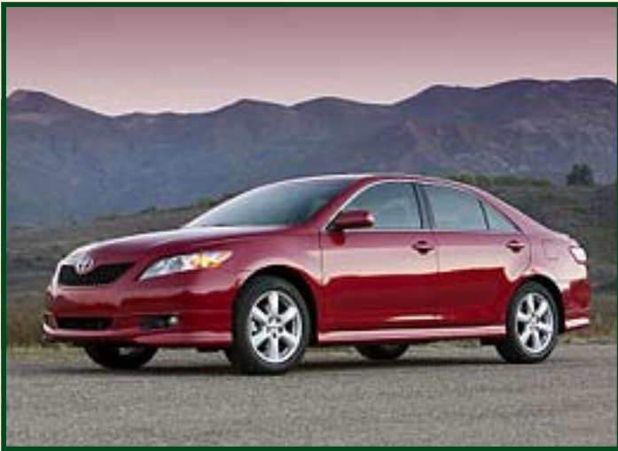
Toyota Camry – top selling sedan